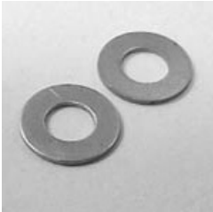
Sold in packages of 10.